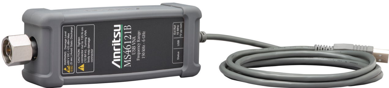
MS46121B ShockLine 1-Port USB VNA